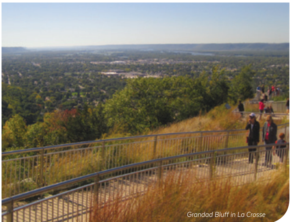
Grandad Bluff in La Crosse