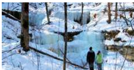
Right: Kickapoo River.