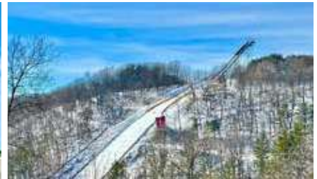
International Ski Jump Tournament