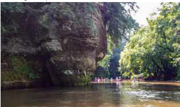
Kickapoo River.