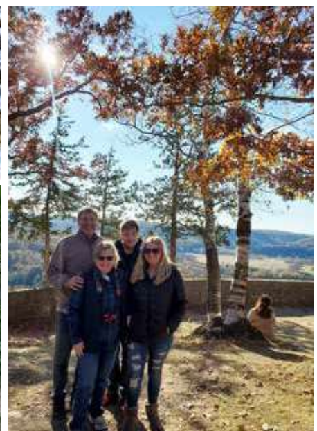
Wildcat Mountain State Park.