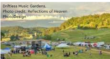
Driftless Music Gardens.