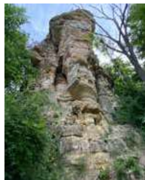
Kickapoo Valley Reserve